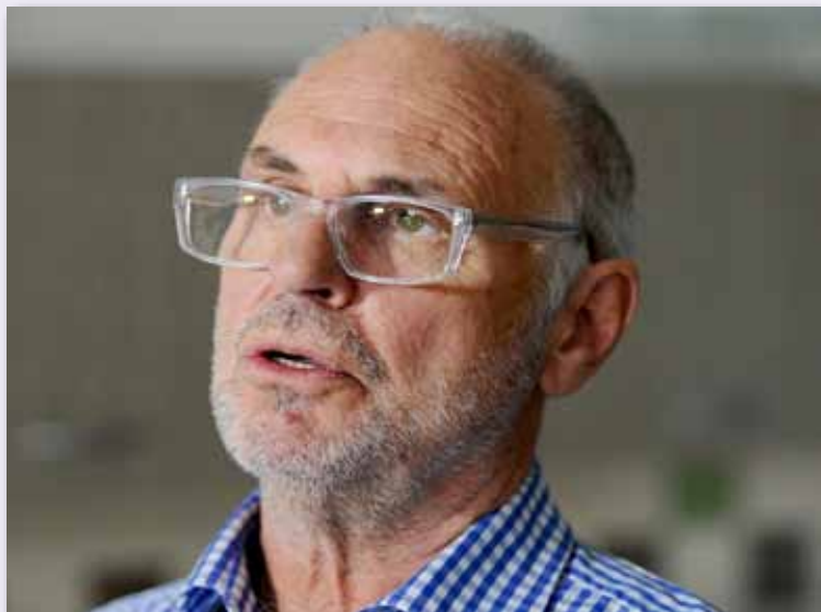
Dr Philip Nitschke speaking out against his persecution by the Medical Board of Australia, noting the scandalous waste of money involved in this political witch hunt & Darwin Monkey trial.

On 1 - 2 April 2015, the NT Supreme Court heard Philip's appeal against the decision of the Medical Tribunal of the NT to leave the Medical Board of Australia's emergency suspension of his medical registration in place.