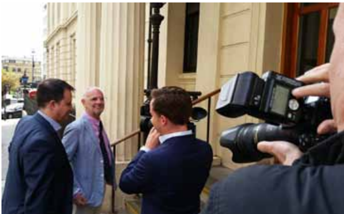
Philip Nitschke at Charing Cross Police Station London, 16 April 2015

But how might you ask has he committed such an offence? Did he spoon out drugs? Did he help someone put a plastic bag over their head? Hell no. The alleged crime is that Philip conducted a workshop in London in June 2013. A run-of-the-mill (if an Exit workshop can ever be described thus) workshop. This was not a workshop that any pro-life objector attended. But it was a meeting that pro-life objectors protested. Although the protestors were paid to protest and none displayed any knowledge of the subject matter of the meeting itself. Indeed, at least one Exit member complained of harassment by the protestors to the MET. Some might say this is a tit-for-tat complaint.