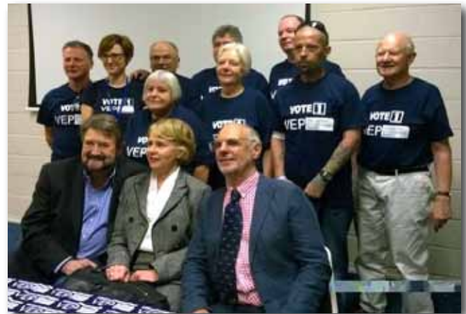
VEP Vic 2014 Campaign Launch: Candidates with Mr Derryn Hinch & Dr Philip Nitschke