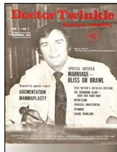
Edition 1 of 'Dr Twinkle'