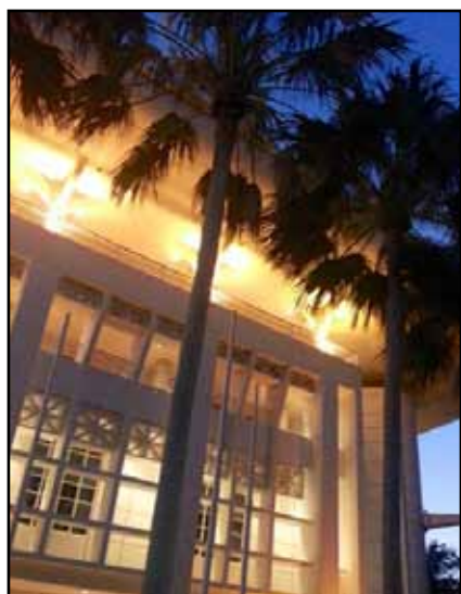
Darwin Supreme Court where the next stage of the appeal will be heard on 1 April 2015