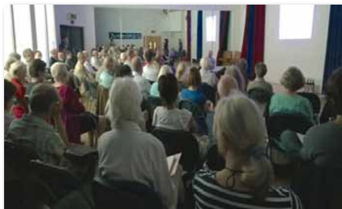
Exit's 2014 London Workshop was again a capacity audience