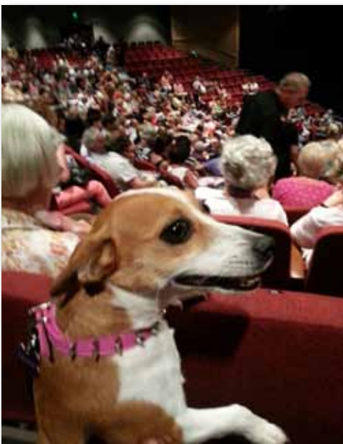
Henny Penny the Dog in the audience at the Perth Festival