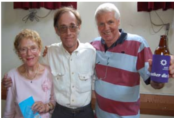
Enjoying the Auckland Exit Chapter lunch