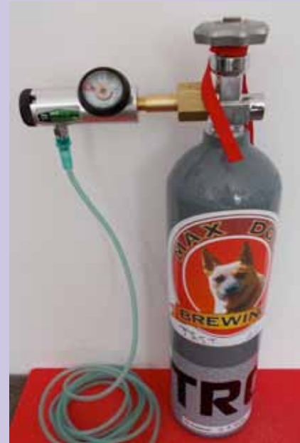
Above: An Australian MDB Nitrogen cylinder

Max Dog Brewing is a unique Exit International initiative which can offer the elderly and seriously ill a reliable and peaceful death at a time of one's choosing.