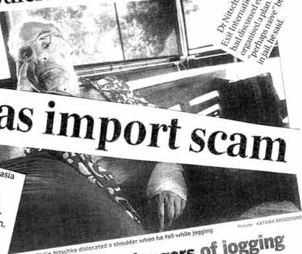
Dr Philip Nitschke dislocated a shoulder when he fell while jogging.