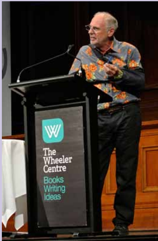
IQ2 Debate Melbourne November 2012

Professional development conferences also figured large in Dr Nitschke's activities in 2012 and included invitations to speak at the annual scientific meeting of the Australian and New Zealand Society of Anaesthetists in Tasmania as well as to the 1000-strong audience at the Australian Nursing Federation annual professional development meeting in Melbourne in September.