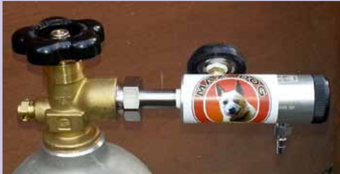
Left: A US MDB Nitrogen Regulator